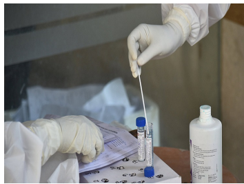
Gandhinagar: A day after crossing the mark of 5 lakh, vaccination figure in Gujarat dropped to 3.55 lakh on Friday. The state reported 36 new cases of Covid-19 in 24 hours. There are 345 active cases

in the state currently, of which 5 patients are on ventilator and 340 are stable. Ahmedabad city reported 8 cases. There were 7 cases in Surat district, including 5 in city and 2 in rural parts. Vadodara city reported 4 cases, Rajkot and Junagadh 2 each, Jamnagar, Bhavnagar and Gandhinagar 1 each. Surendranagar reported 2 cases, Sabarkantha, Anand, Dahod and Gir Somnath 1 each. A total of 61 patients recovered from Covid-19 on Friday, taking the number of recoveries so far to 8,14,223. The recovery rate has reached 98.74 per cent. The number of Covid-19 vaccines administered during the day dropped sharply to 3,55,953. The overall vaccination figure till now has reached 3.10 crore.